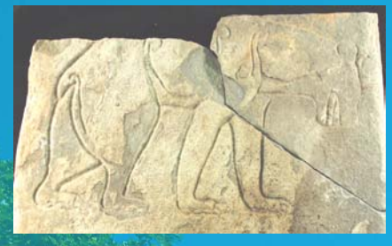
Old Scatness Jarlshof Environs Project A Shetland Amenity Trust/University of Bradford Heritage Project.